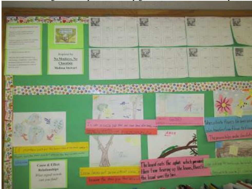
Book maps (top) and revised text with cause and effect structure.

Here are some great examples created by grade 4 students at Kennedy School in Billerica, MA.