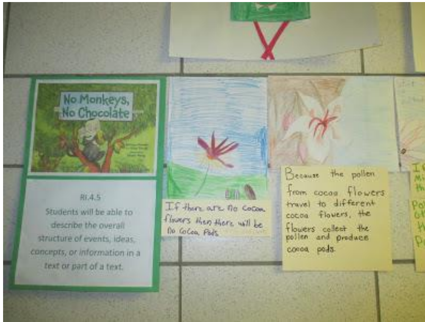
Examples of revised text with cause and effect structure